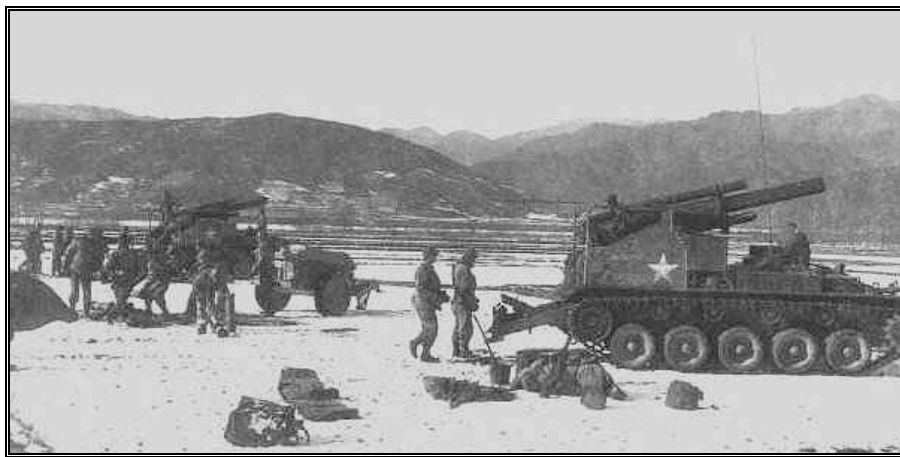
TF Dog's 92 nd FAB elements support the Marines' withdrawal. Chinhŭng-ni, December 1950

For the majority of the warm-blooded Borinqueneers seeing snow for the first time, the challenge of coping and surviving presented but an opportunity to employ their resourcefulness. Dressing in layers compensated for the lack of right winter equipment; carrying their ration cans under their armpits kept the food warm enough for eating; and keeping their canteens under their clothing kept the water usable. Individual weapons were maintained relatively dry. The men had learned that an excess amount of grease or oil allowed to remain on weapons after they were cleaned called for a jam and failure to fire. The trick to keep mortar tubes from shrinking or cracking consisted of setting the mortar base plates on top of furnaces dug in on the ground and keeping the tubes covered with tarpaulins until ready for use. In extreme cases, crew-served weapons had to be urinated upon to be thawed for operation. This exceptional performance in subzero temperatures so impressed Harris that he would go on to publicize his men everywhere they went in Korea. Somebody had been selling the Puerto Rican soldier too low.