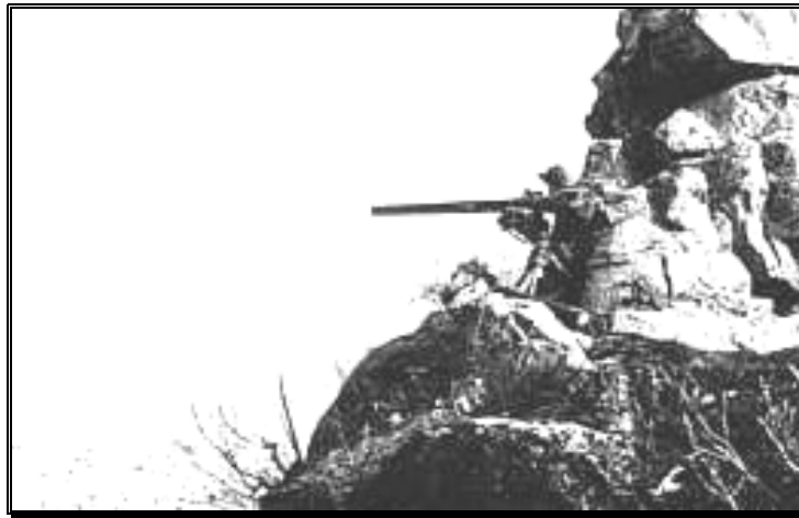
A 75-mm recoilless rifle position guards the MSR. North of Hamhŭng, December 1950

If for whatever obscure reason TF Dog's role has gone relatively unrecognized, outshined by the glamour of the heroic Marine role during the withdrawal, the role of sister task force Childs has gone virtually inexistent. In fact, so closely intertwined have been these task forces that yet many members of TF Childs still believe they had operated under TF Dog all along. Dubbed after its tactical commander, Lt. Col. George W. Childs, regimental executive officer of the 65 th , this 1,850-strong task force consisted of the core of 2/65 and 3/65, powerfully supported by units of field artillery, engineer, armor and chemical. Thus, while TF Dog's mission would consist of helping the Marines fight their way southward along the withdrawal route, TF Childs' would consist of holding the highlands in front and eventually to the west of the MSR.