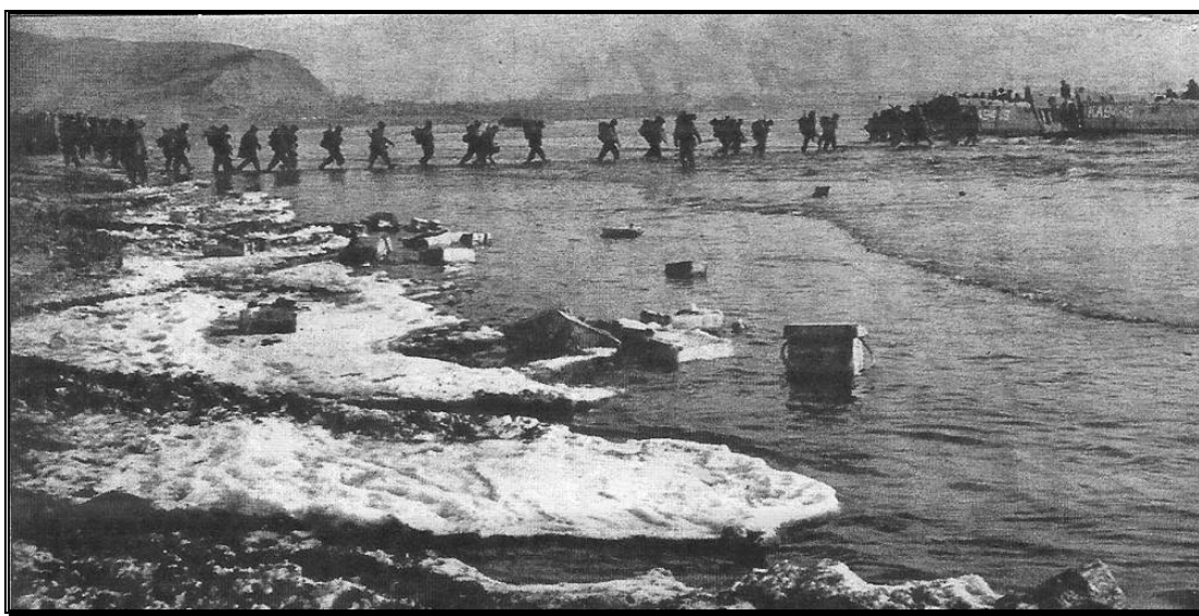
Unidentified troops (probably Marines) “LEAVING THE BEACH AT HUNGNAM” in this David Douglas Duncan picture featured in the January 8, 1951 edition of Time . The celebrated photographer topped off his description of the action with a sardonic, “If the enemy had used artillery ...” to illustrate the grimness of the scenario

Behind it, the Hŭngnam Harbor sank into the ocean under one sky-high pillar of smoke.