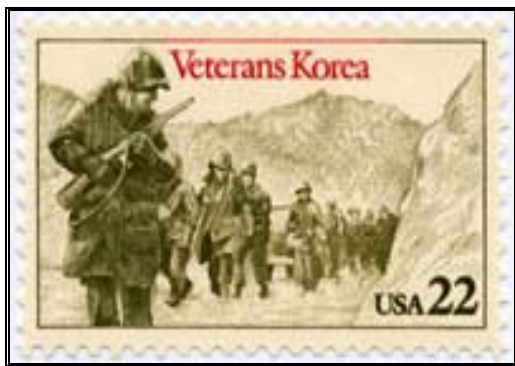
U.S. Postal Service Korean War Commemorative Stamp (1985) depicting soldiers of the 65 th Infantry Regiment

Men took advantage of every moment of calm to doze off. Some slept sitting up, back to back with their buddies; others hugged the warm hoods of the vehicles. David Duncan had a ball on account of the misery of the men, and busied himself in taking pictures of his revered “leathernecks,” almost entirely ignoring the 2,300 “doggies” in the column. In what might be taken as a paradigm of poetic justice, one of his pictures of soldiers would be immortalized in a 1985 United States Postal Service Korean War Commemorative Stamp. Misidentified in Clay Blair’s The Forgotten War as a medical platoon from 2/31, the squad featured in the picture was “not Marines,” but “soldiers belonging to a Reserve unit, according to what they told me, from Puerto Rico,” as Duncan himself remarked in the December 25 edition of Life .