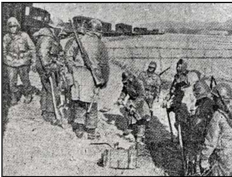
Borinqueneers set demolition charges around “Liberty City.” December 1950

been easily repulsed, the uncanny CCF recurred to a tactic the Borinqueneers were already familiar with: psychological warfare. That is, large numbers (approximately 2,500) and a lot of mass singing, bugling, and cymbal-clashing. The ensuing battle culminated with morning light finding about 1,000 CCF troops lying in the snow, wounded or dead. In spite of incessant air strafing, and a rain of shells from U.S. artillery and from warships offshore, the enemy maintained his pressure throughout the day. At night, star shells and flares illuminated the scene, which was the only practical way of countering the enemy's much annoying penchant for night fighting.