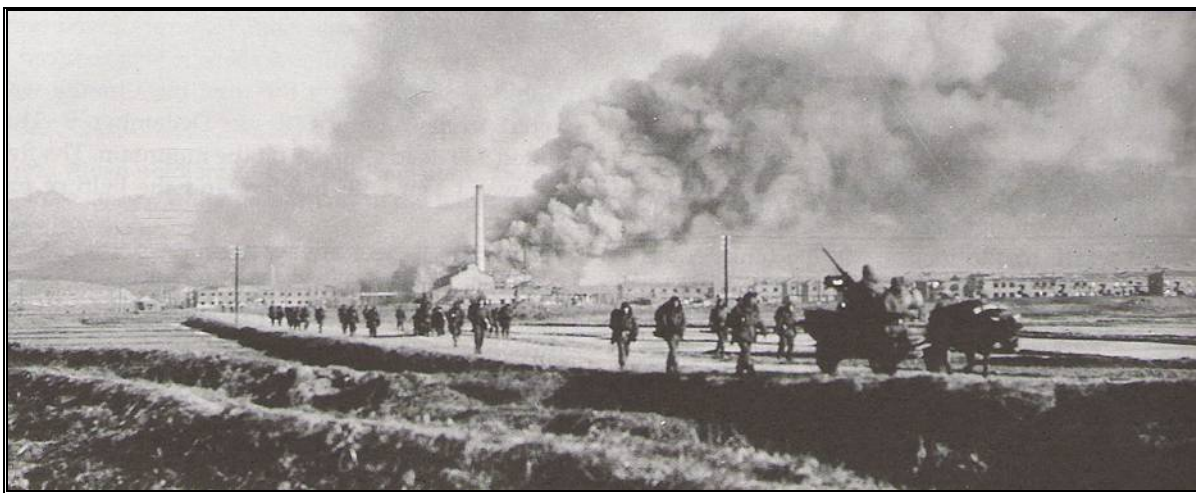
Another burning village, courtesy of the Borinqueneers, (here using ox-carts to transport their equipment). Near Hŭngnam, December 1950 (National Archives)

In the personal sense, the evacuation constituted a victory for Ned Almond, when compared with the disarray on Johnnie Walker's EUSAK after the loss of the 2 nd Division and most of its heavy equipment at the Kunu-ri Pass. As far as the refugees are concerned, Almond strove to live up to his word to evacuate as many as he could when the option of a ground evacuation was ruled out for safety reasons. Unfortunately, of the more than 180,000 hoping to evacuate, only 91,000 would.