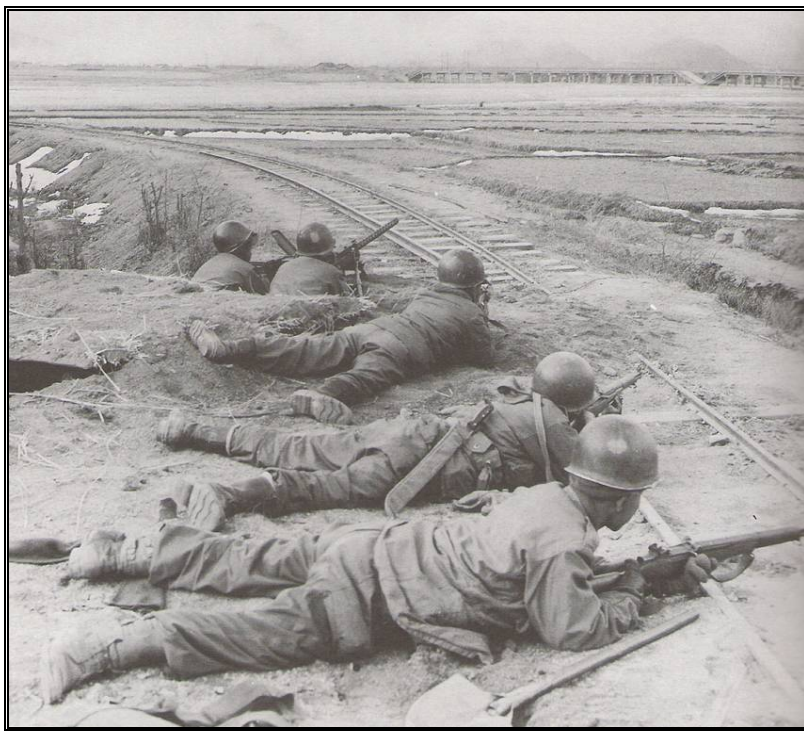
Borinqueneers man a machine gun position south of burning Oro-ri. December 1950