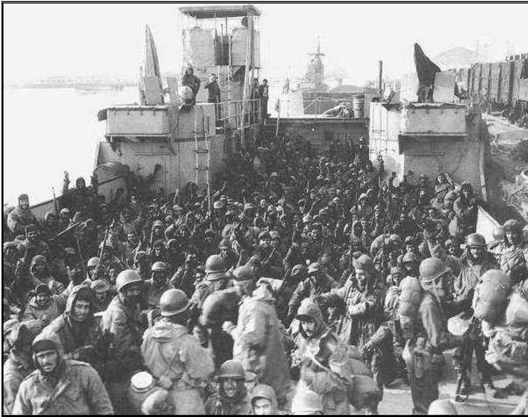
Elements of the 65 th Infantry Regiment (“Borinqueneers”) withdraw from Hŭngnam. Christmas Eve 1950

During the past seventeen months that I have commanded this regiment, I have frequently reiterated my complete and unbending confidence in the fighting ability of the men of the 65 th ... That record speaks for itself ... With humble sincerity, I congratulate and thank all of you. To each of you, I extend my very best wishes for a Merry Christmas and a Happy New Year.