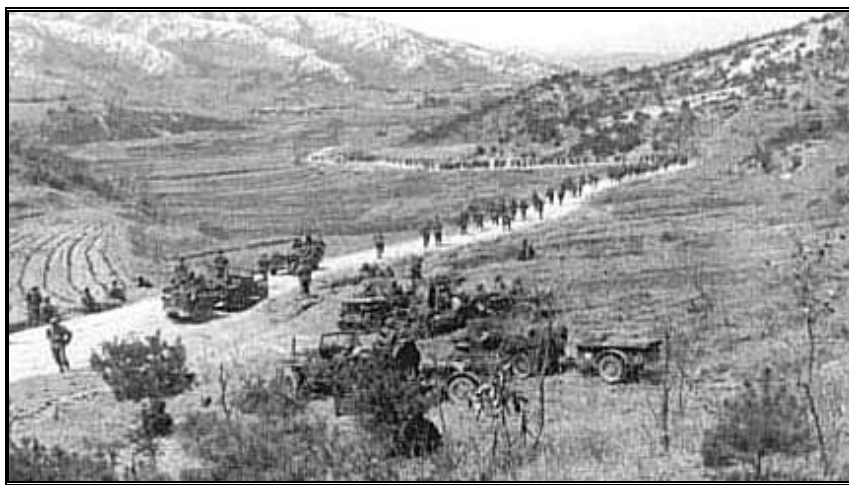
The Borinqueneers withdraw to UTAH Line. April 1951

troops assembled close to the division headquarters near the junction of routes 33 and 11. With considerable difficulty, 1/7 returned to its regimental sector on KANSAS Line, and went into reserve.