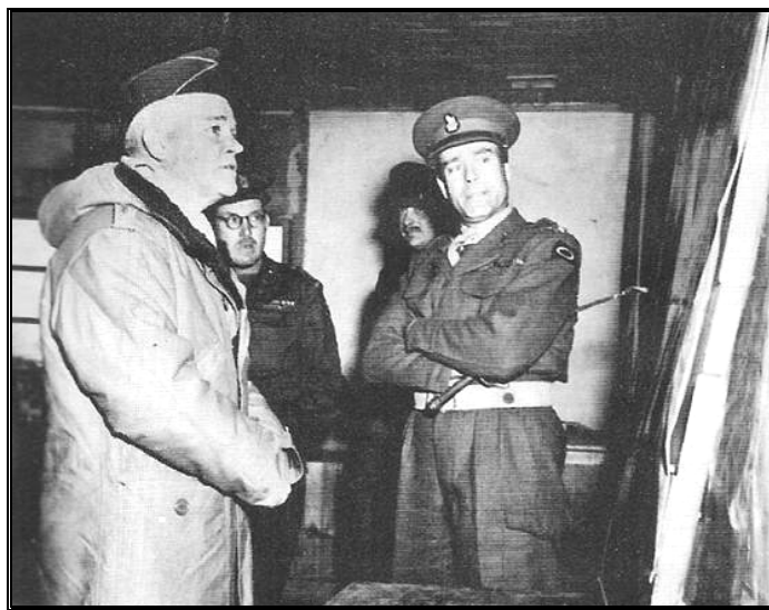
Brigadier Tom Brodie (right), CO British 29 th Independent Brigade, here briefing J. Lawton Collins during the Army Chief of Staff's visit to Korea. January 1951