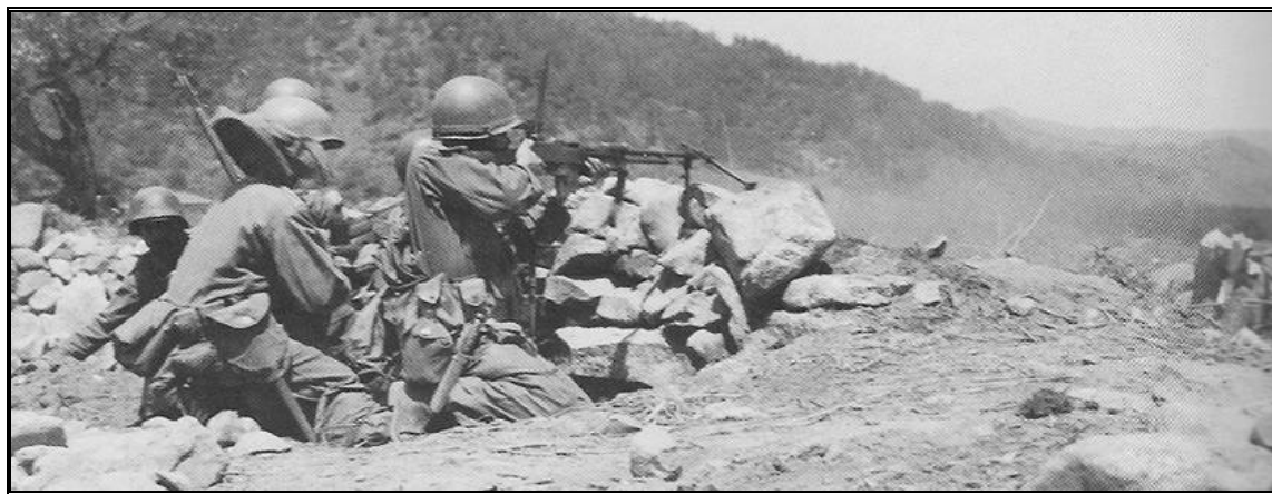
A Borinqueneer BAR man engages enemy positions during the CCF Spring Offensive. April 1951