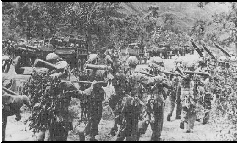
Chinese Communist Forces move up for the attack. Spring 1951

Red China's Premier Mao Tse-Tung was positive that his impending offensive would bring a definite communist victory in Korea. There would be no peace talks. Humbug! He counted on all the fundamentals for victory. Firstly, he had more trained and skilled fighting men (three new CCF army groups comprising 27 divisions), plus ancillary engineer and artillery forces; secondly, an optimal supply and distribution system, particularly for food and ammunition (the Iron Triangle); and, thirdly, above all, better weapons (Russian-made): automatic rifles for the infantry, and lots of artillery and anti-aircraft guns).