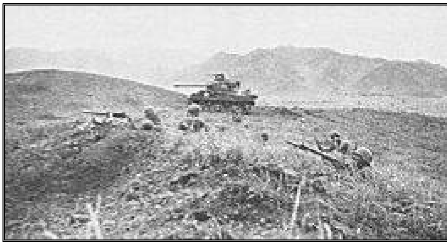
Elements of King/65 defend their gains north of the 38 th Parallel. Spring 1951

"Nobody but the Glosters could have done it."