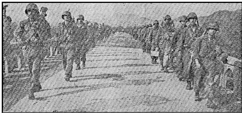
Borinqueneers on their way to reinforce their regiment on the front. Somewhere in North Korea, circa Spring 1951

The enemy's withdrawal opened the path all the way to the 38 th Parallel. The question in early April was whether to cross it again.