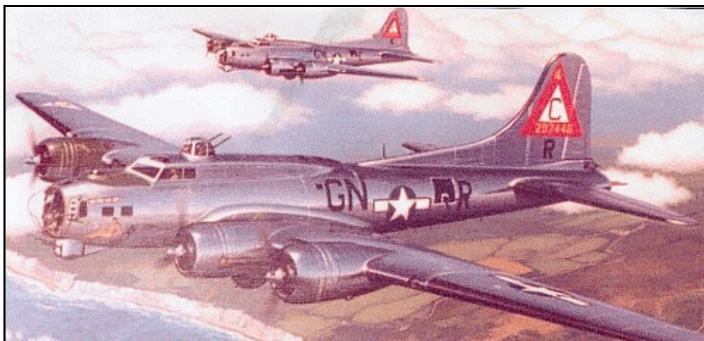
B-17G - NATURAL METAL FINISH FUSELAGE LETTERING CHANGED TO BLACK

In October, the factory no longer applied camouflage to the combat aircraft. With the return of the natural silver, the radio call letters on the sides of the B-17s were changed from yellow to black. Dark olive paint was applied in front of the cockpit and on the engine cowlings for anti-glare purposes.